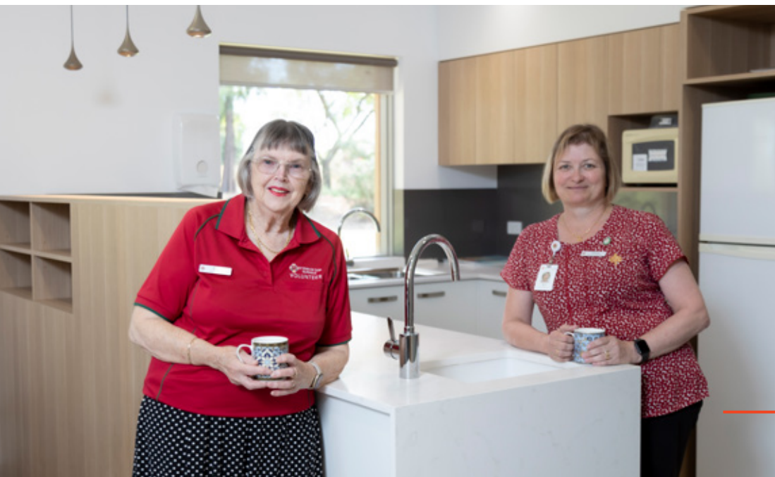
Pictured: Caregivers enjoy the refurbished facilities at St John of God Murdoch Hospice.

St John of God Foundation raises funds to support transformational patient care and leading medical research, to directly improve health outcomes for patients and the broader community. Find out more at www.sjogfoundation.org.au 🍷