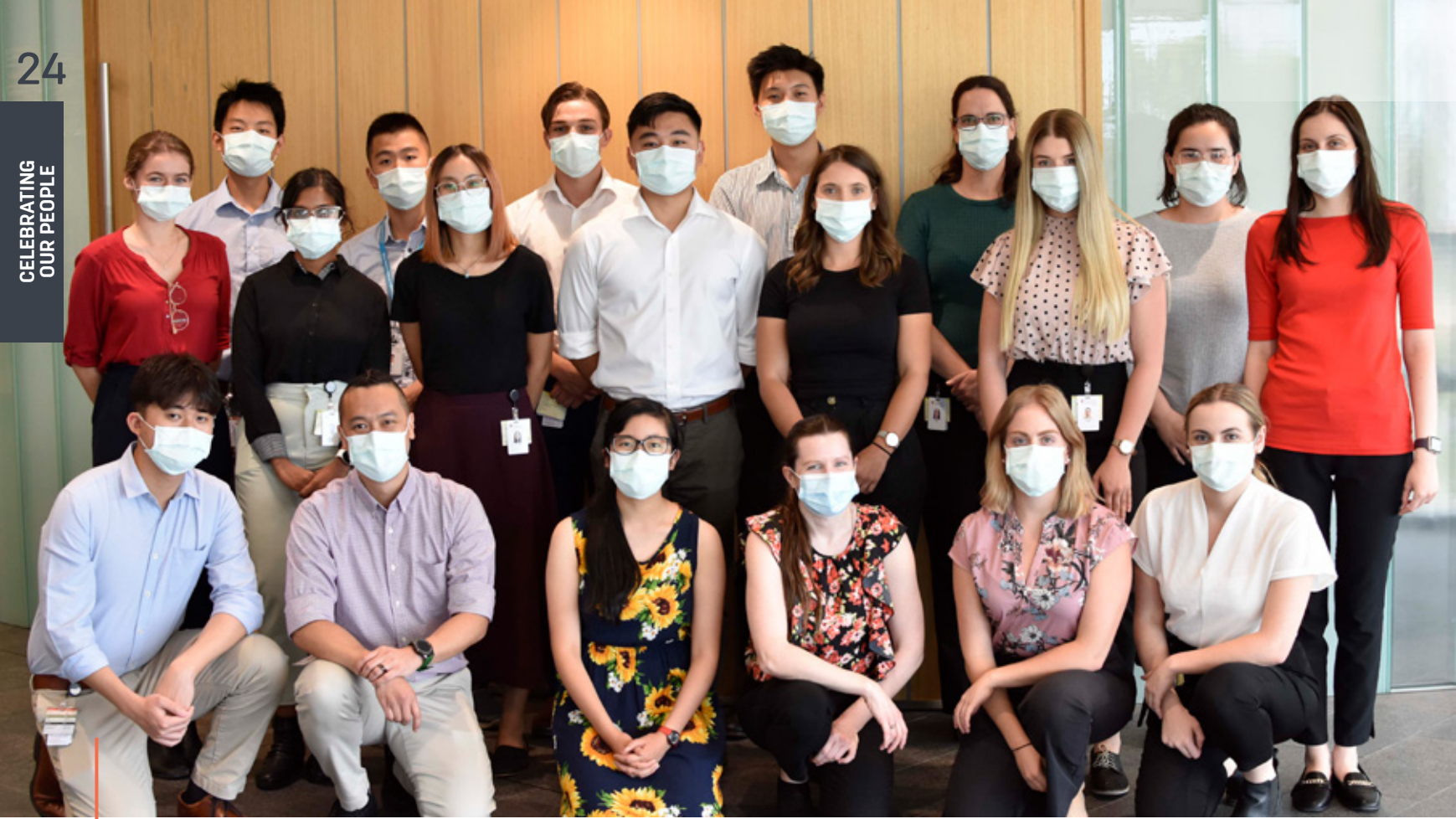
Pictured: St John of God Health Care's 2022 medical interns cohort.