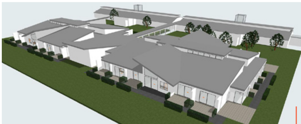
Pictured: Lucena Unit Design