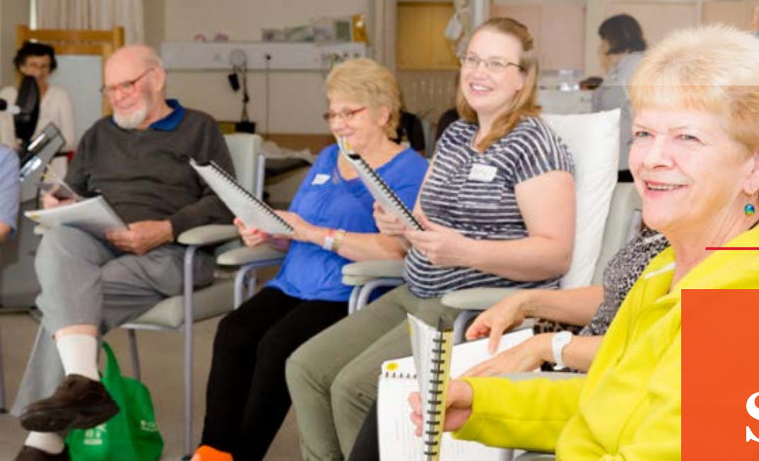
Pictured: Patients participate in singing with Viva Voices on a visit to St John of God Frankston Hospital.