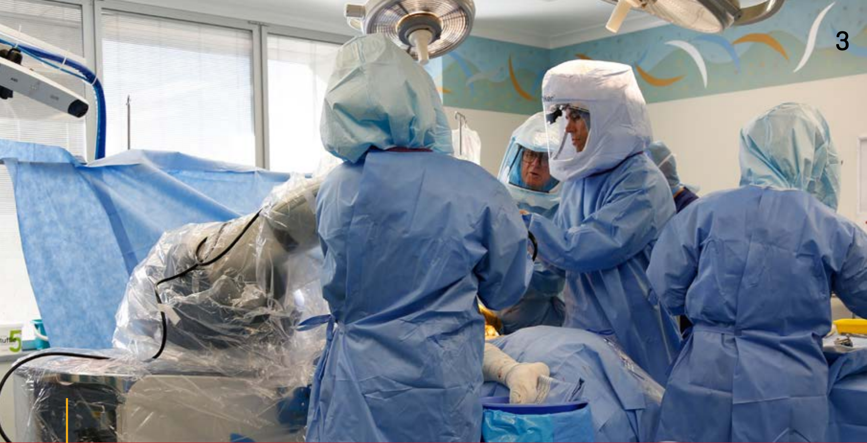
Pictured: Orthopaedic surgeons at Subiaco Hospital were the first in Western Australia to use an interactive orthopaedic robot for partial knee replacement (PKR) surgery in April

“The robot technology is part of our focus to assist our doctors and patients by providing first-class facilities and the latest technologies,” he said.