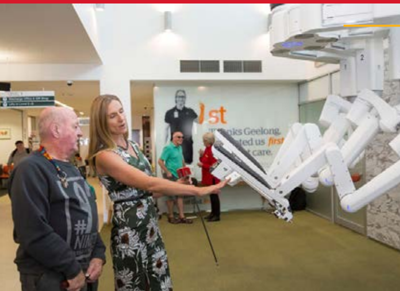
Pictured: The new da Vinci Xi robot generated great interest from patients and caregivers when a demonstration of the new technology was held in the foyer of St John of God Geelong Hospital