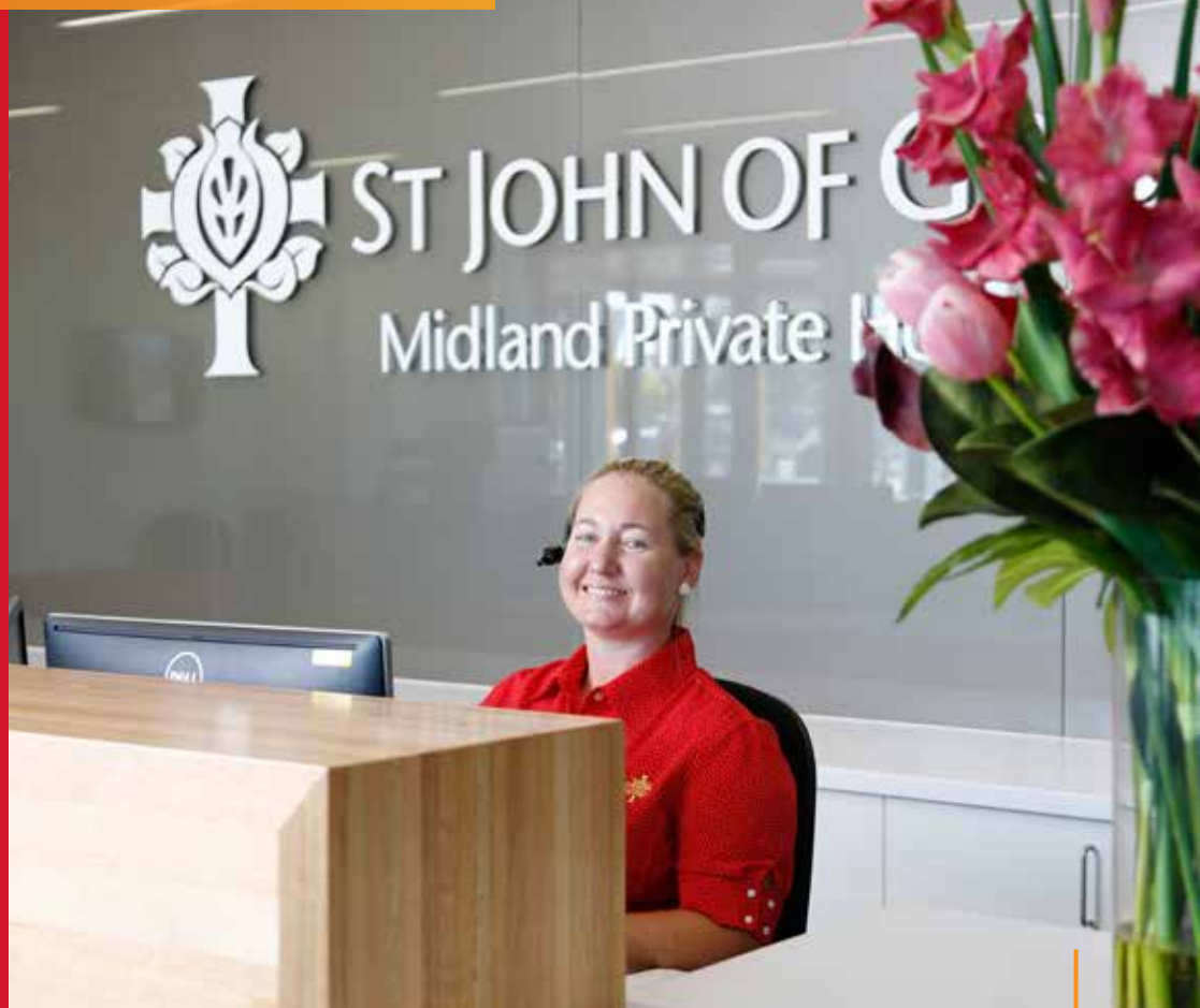
Pictured: St John of God Midland Private Hospital is providing a choice for patients east of Perth.

"For private patients who are admitted through the public emergency department, the new private hospital provides the option of a different level of comfort and amenity supported by private health insurance.