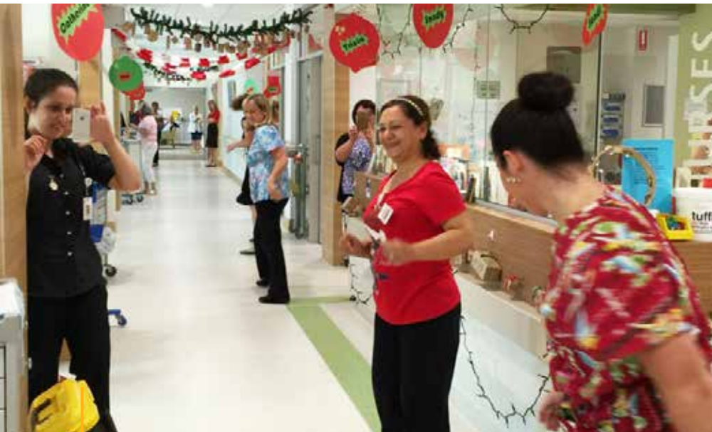
Pictured: Flash mob on St John of God Murdoch Hospital ward spreads joy.