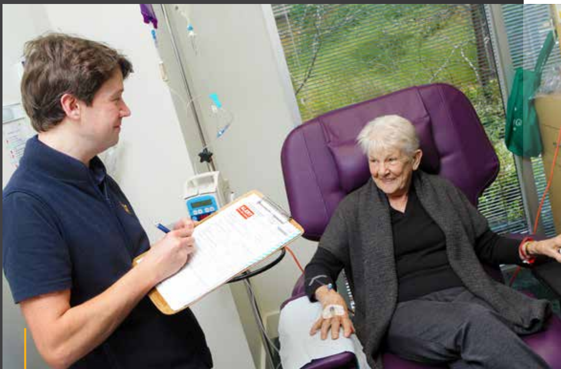
Pictured: Research and clinical trials are central to delivering the most effective, evidence-based care to patients.

As part of the hospital’s holistic approach, a cancer nurse practitioner works closely with the cancer care team to optimise care planning and